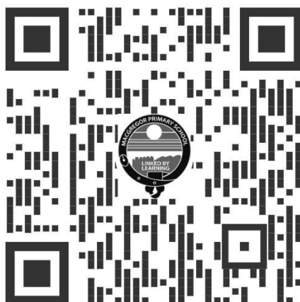
Athletics Carnival Volunteer Form

If you would be able to assist on the day, please either click the link , or scan the QR code to provide your details.